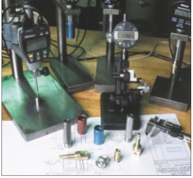
"We run 60 percent steel, 35 percent aluminum and 5 perlower cost than might be cent brass," Barrie says. The steels are 12L14, 12L15, 1144 achieved by other processes is a stress-proof and 1144 fatigue-proof. Every part is of a differreal strength. However, Barrie ent material, or at least a different diameter of the same

Clearly trying technology to an overall manufacturing/ machining strategy-